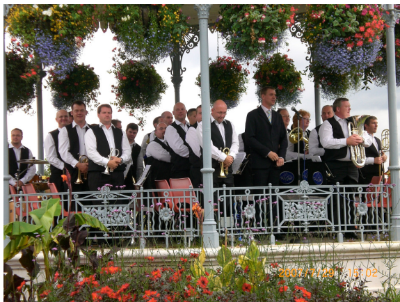
Polysteel Band end their performance in Falmouth Pavilion Bandstand

Sunday afternoon's concert was set in the beautiful surroundings of the bandstand at Pavilion Gardens in Falmouth where yet another packed crowd enjoyed the music on what was a glorious summers afternoon, with the programme being a repeat of the previous evening's music. There was time at the end of the concert for the players to relax with a small tippie before making the long journey back home to (a rather flooded) Gloucester. The management and players of PolySteel would like to pass on their thanks to all the members and staff of Hayle Town Band for their wonderful hospitality over the weekend and hope it's not too long before the band is once again asked to perform in the county of Cornwall.